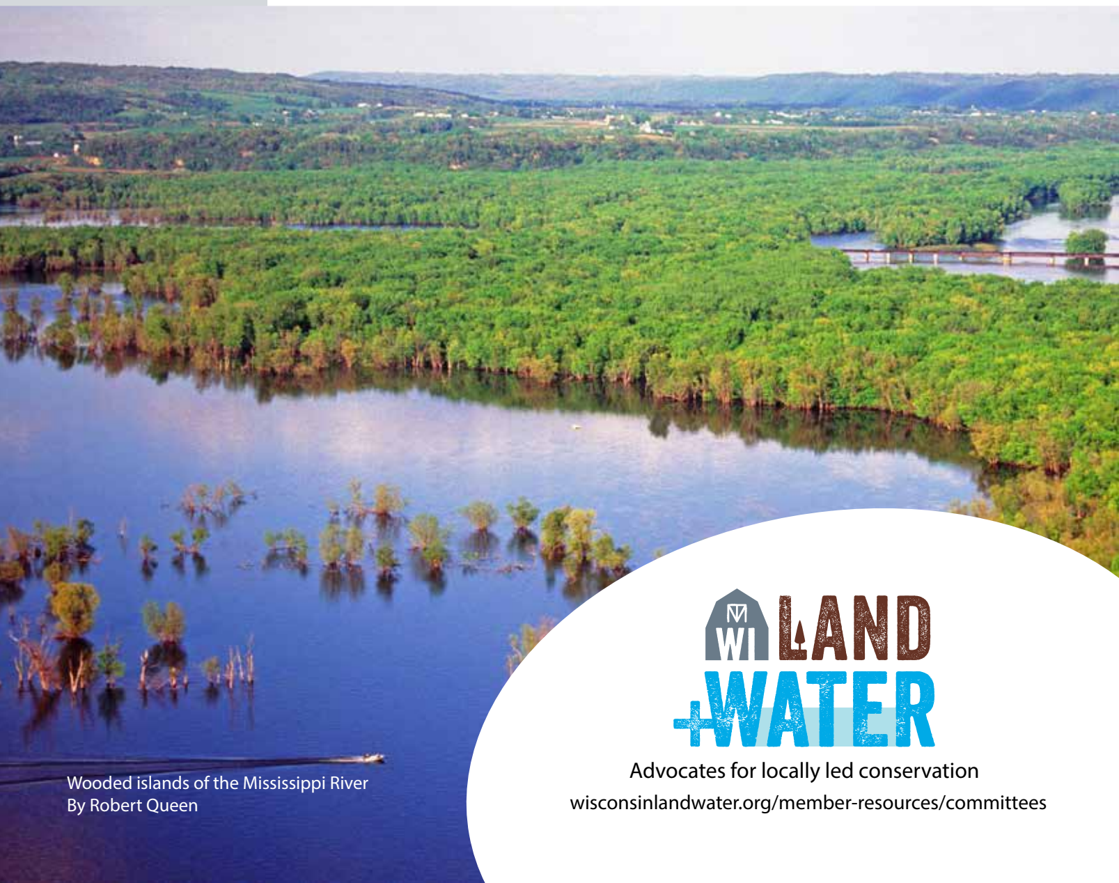
Wooded islands of the Mississippi River By Robert Queen

The Mississippi River Basin Committee is the newest WI Land+Water committee. While the guiding principles are yet to be determined, the motivation for creating the committee is to bring counties together to collaborate on a basin-wide approach.